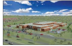
Rendering of Fort Knox Elementary School, Fort Knox, Ky.

Reyes Construction Inc. are among those being awarded a firm-fixed-price, IDIQ multiple-award construction contract for airfield paving and heavy duty paving projects across NAVFAC Southwest.